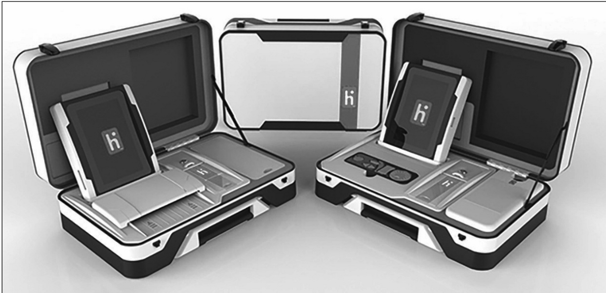
IF YOU VOTE AT THE POLLS on June 2, you will be using our new voting machines. The Verity Scan is a digital scan ballot tabulator that is used in conjunction with an external ballot box. The unit is designed to scan marked paper ballots, interpret and record voter marks on the paper ballot and deposit the ballots into the secure ballot box.

Emergency Absentee ballots have a more simplified process. More than one voter may now designate the same person to deliver their ballot. For example, the same hospital employee may deliver ballots for multiple patients.