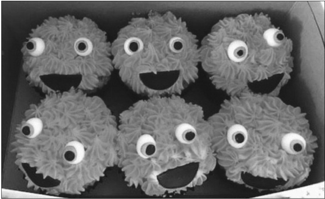
Gritty cupcakes from Kia’s Cakes are good company

As far as I know, this small, family owned grocery store has yet to ever run out of toilet paper or paper products. They have wonderful deli meats, prepared foods, hoagies, and salads, but are probably best known for frozen Italian specialties such as stuffed shells and ravioli. Put dinner on the table and get some staples to see you through! (610) 626-6330, 199 Shadeland Ave.